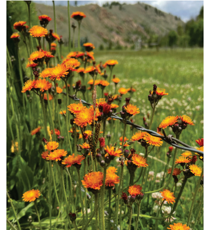
ORANGE HAWKWEED "LIST A" NOXIOUS WEED

Noxious weeds are non-native, invasive species. They are aggressive, spread rapidly, possess the ability to reproduce profusely, and can be challenging (but not impossible) to control.